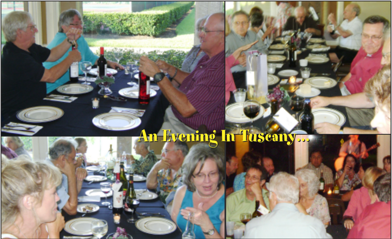
An Evening In Tuscany...