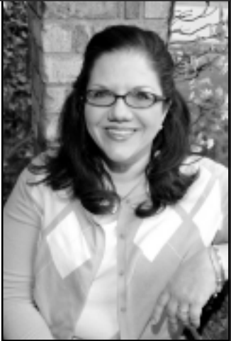
DEERFIELD RESIDENT FOR OVER 20 YEARS