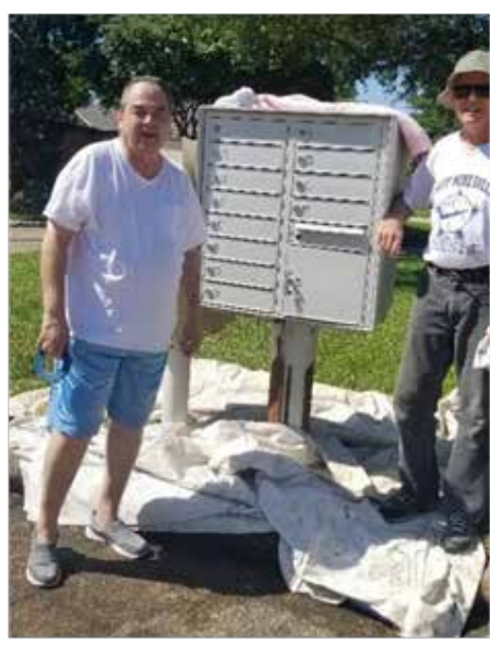
Repainting a mailbox cluster in the Patio Homes.

MOON LANDING On July 20th we will host an event celebrating the 50th anniversary of the MOON LANDING from Apollo 11. It will be an "out of this world" experience.