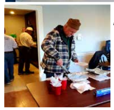
"DVF Campers enjoying pancake breakfast on Nov. 10th"