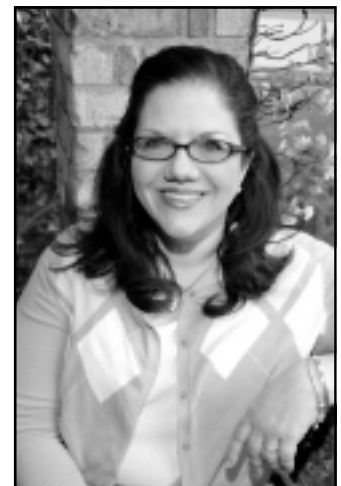
DEERFIELD RESIDENT FOR OVER 20 YEARS