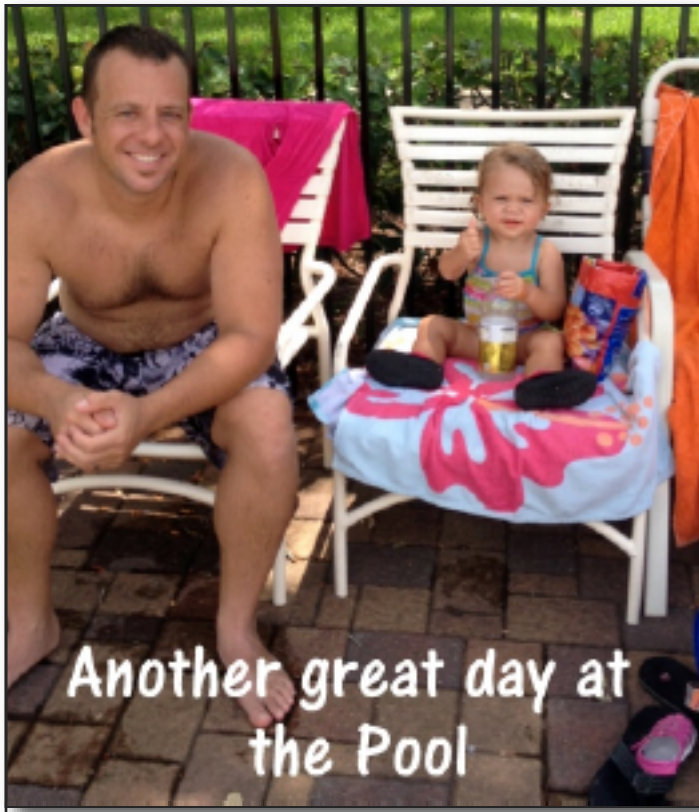
Another great day at the Pool