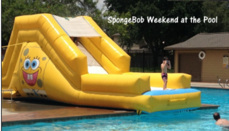
SpongeBob Weekend at the Pool