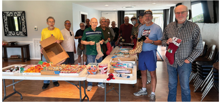
TMG stuffing 60 stockings for those in need