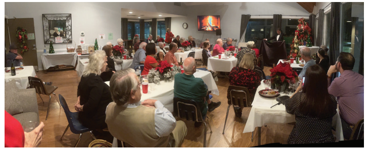
Deerfield 2022 Christmas party with magician