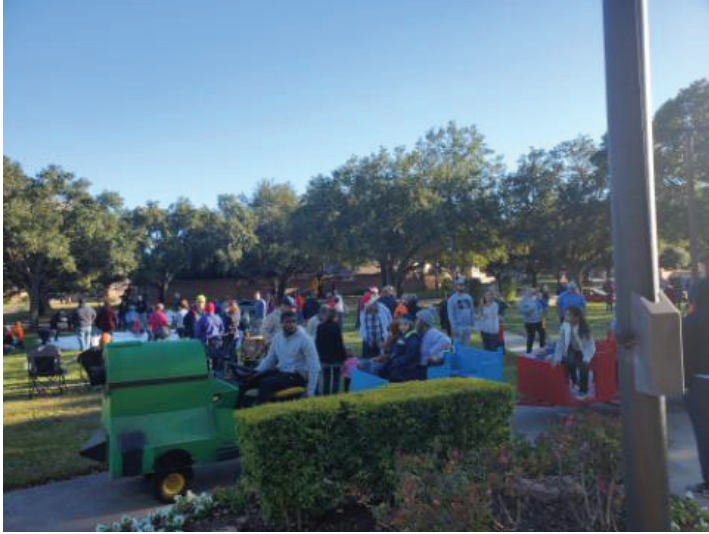
HAPPY NEW YEAR 2024 from the Day Trippers group