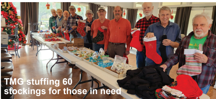
TMG stuffing 60 stockings for those in need