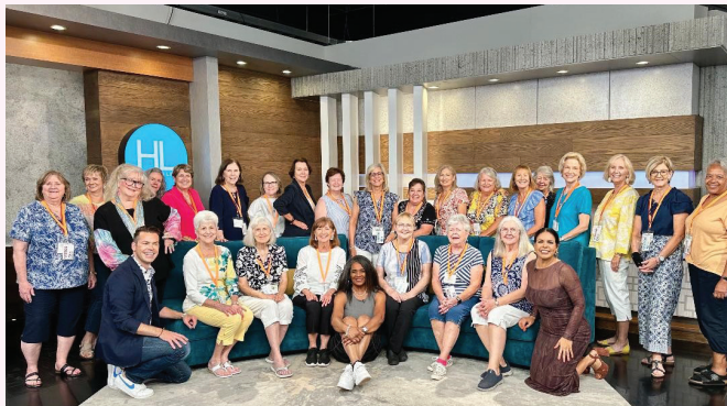
June Trip to KPRC Channel 2 Houston Life

Those who register will be notified if plans change.