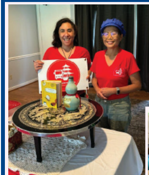
Photos from DDT July Tea Tasting

CONGRATULATIONS TO 5015 Chantry 5026 Hastingwood